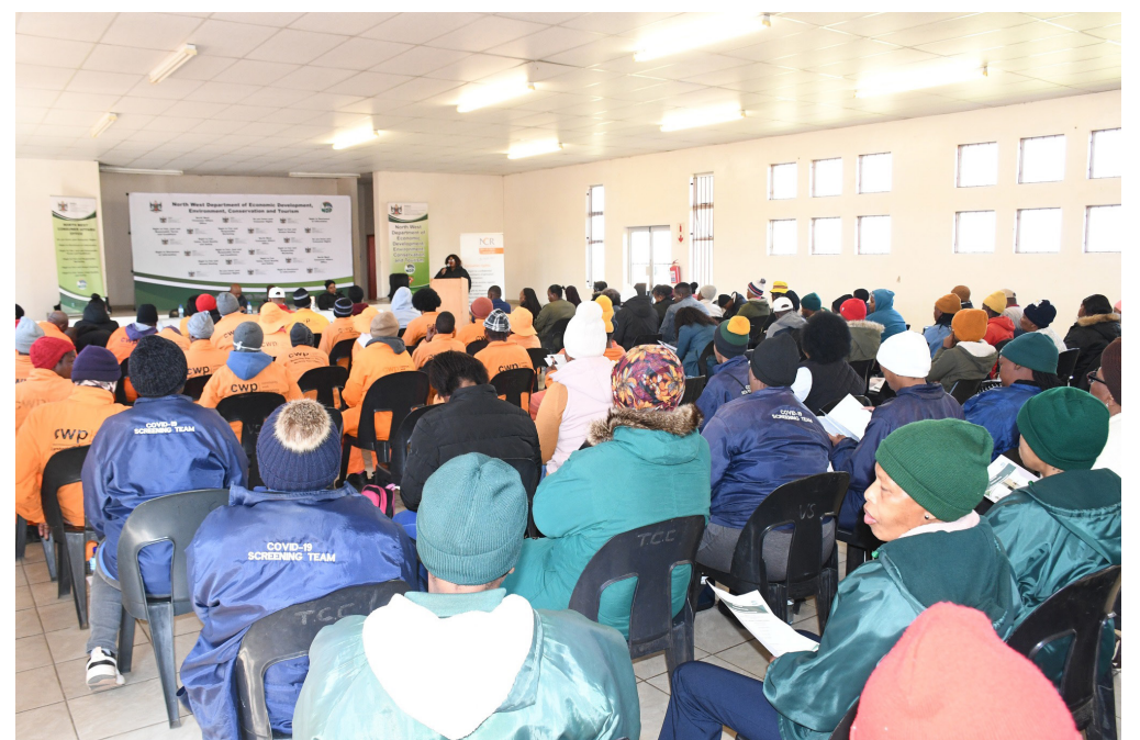
Attendees at the consumer workshop which was held in Ventersdorp

The Department will continue with these awareness campaigns and roadshows in all district of the province in order to empower our consumers to make the right choices. The next roadshow will be held on 15 June 2023 at the Boxer Centre in Brits, come through and know your consumer rights and responsibilities.