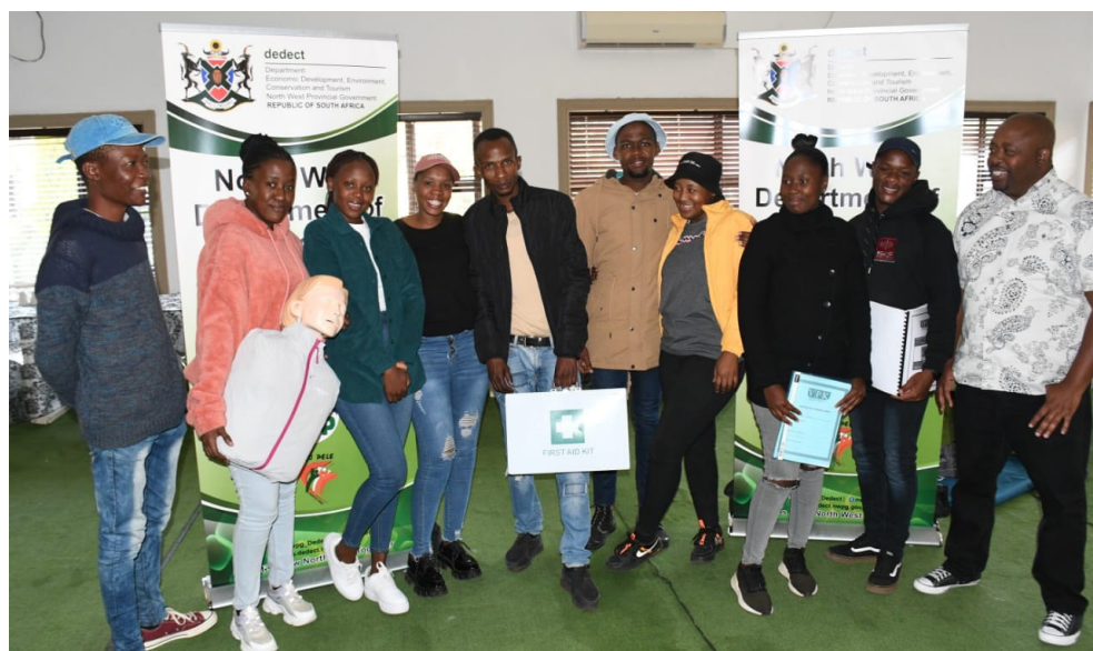
Trainees undergoing CPR training as part of the course to receive their registration as tourist safety monitors

T he Department of Economic Development, Environment, Conservation, and Tourism concluded the facilitation of another two-day First Aid Training for nine (9) youth who were placed Under the National Tourism Safety Monitors Programme in Mogwase around the Moses Kotane Local Municipality.