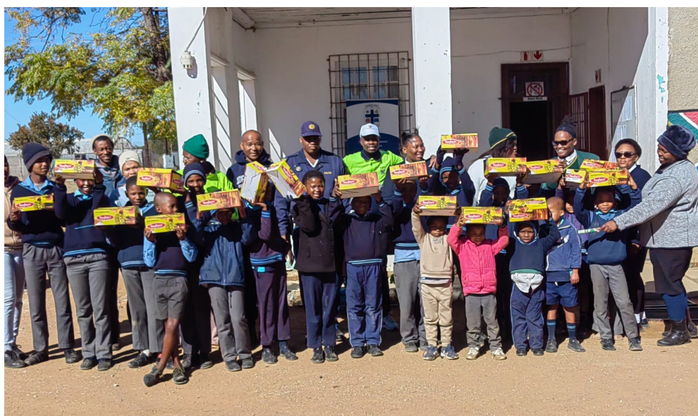
Devondale Primary School learners receiving school shoes as part of the Departments social responsibility programme

The department will continue with its social responsibility programme throughout the province whereby liquor traders are encouraged to take part in the programme as it serves as an integral facet of the doctrine of Ubuntu, and to change the way the Liquor Industry operates.