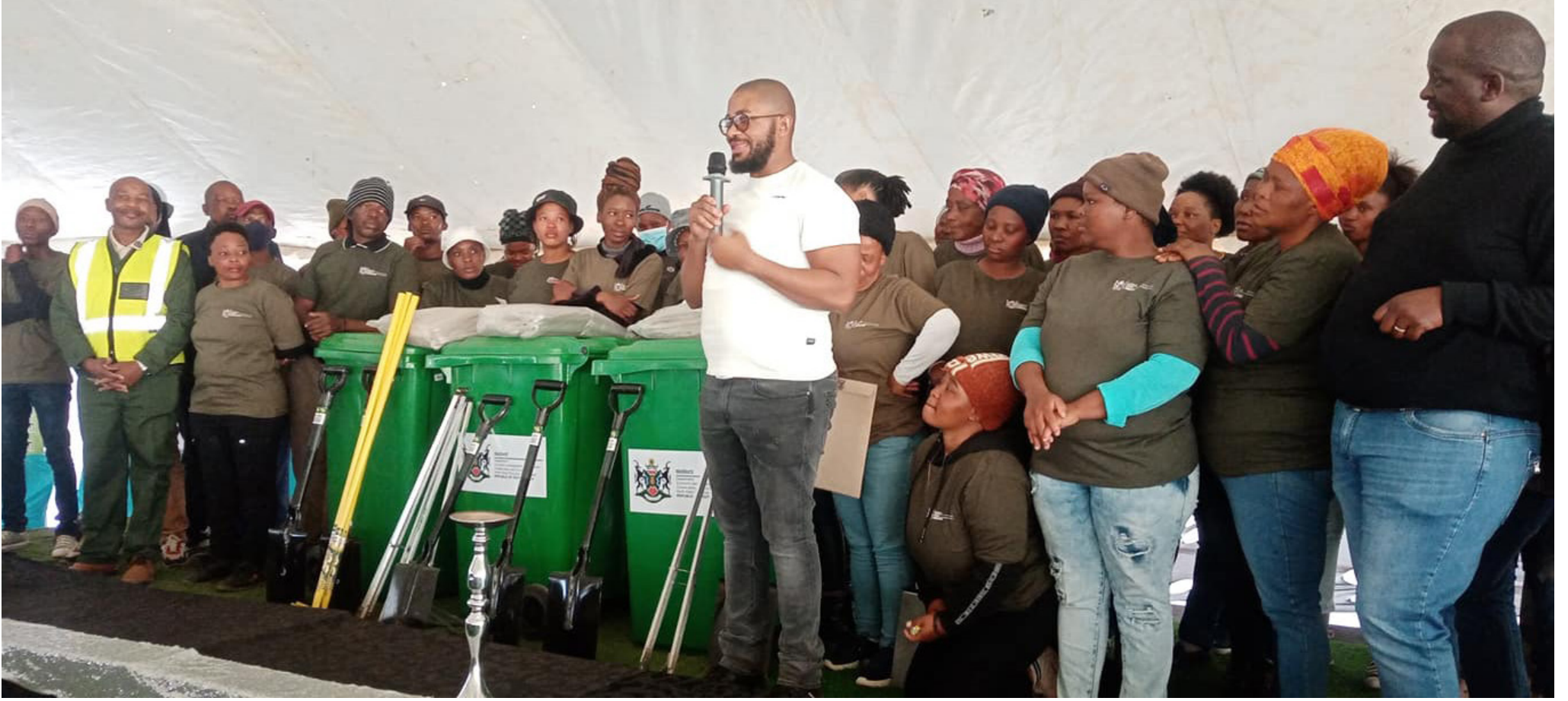
The department donated wheelie bins and tools as part of the effort to eradicate waste in Leeudorinstadt

The North West Department of Economic Development, Environment, Conservation and Tourism (DEDECT) commemorated the North West Provincial Environment Day at the Kgakala Location Sports Ground, Leeudorinstadt, in the Maquassi Hills Local Municipality. The day was commemorated under the theme “people’s actions on plastic pollution matters”, emphasizing the importance of sustainable living in harmony with nature and advocating for transformative changes in policies and individual choices towards cleaner and greener lifestyles.