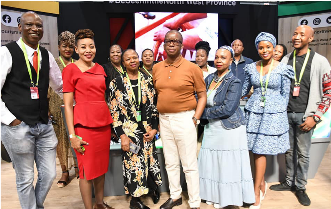
Team North West at Africas Travel Indaba

The 3-day Africa's Travel Indaba concluded with a line-up of seminar discussions focusing on insightful topics such as 'Speed Marketing – Wild n out in South Africa and Future Forward: Learning, unlearning, and relearning a journey towards building a compelling and sustainable brand. The topics are intended to benefit small businesses who are still striving to grow, sustain their businesses and stay competitive in the market.