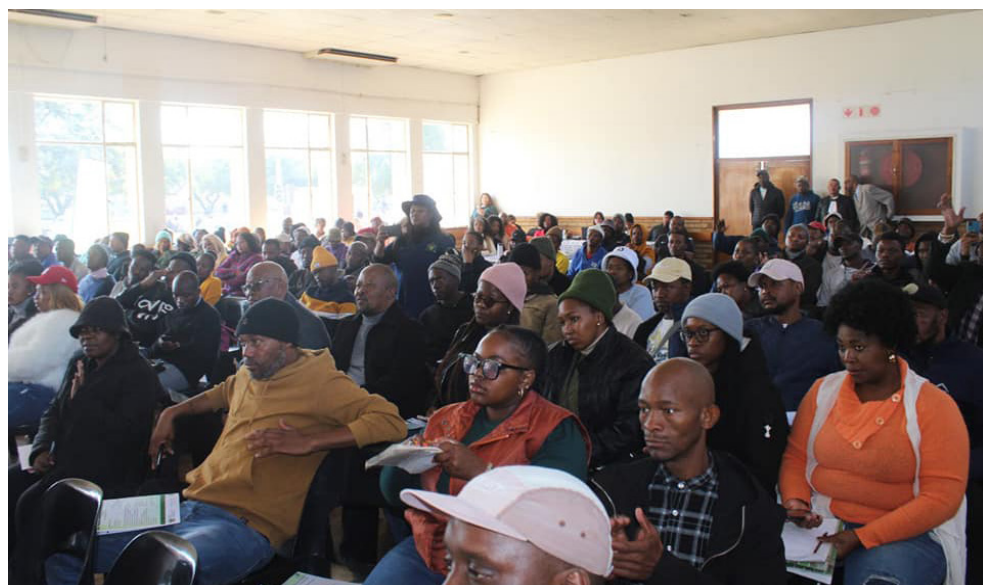
Youth attendees in their numbers attending the outreach

The Department of Economic Development, Environment, Conservation and Tourism (DEDECT) as mandated to assist SMMEs particularly women, youth and people with disabilities, to prosper and contribute in job creation, kick-started its Youth Month SMME Outreach Programme in Lichtenburg in order to accelerate information sharing, education and services to Youth Owned SMMEs. These sessions continued in all four districts of the province.