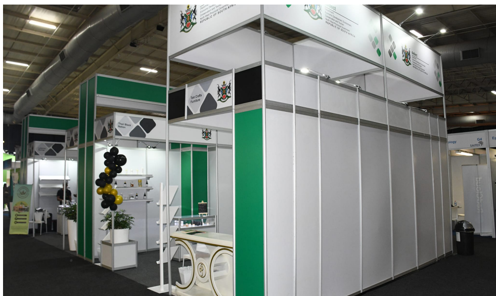
DEDECT Exhibition stands at SAITEX for 10 Small Businesses to market their products and services

It is part of the department's initiative to create a conducive environment for SMME's in order for them to have access to the market at large.