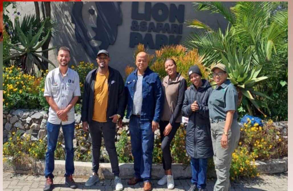
Some of the youth who have been placed by the department at various hospitality establishments

The North West Department of Economic Development, Environment, Conservation and Tourism has created an opportunity for eligible unemployed youth graduates to be part of the North West Tourism and Hospitality Placement Programme for 2022/23. Through this programme, 91 unemployed youth were allocated work opportunities and placement at tourism establishments across all districts of the province.