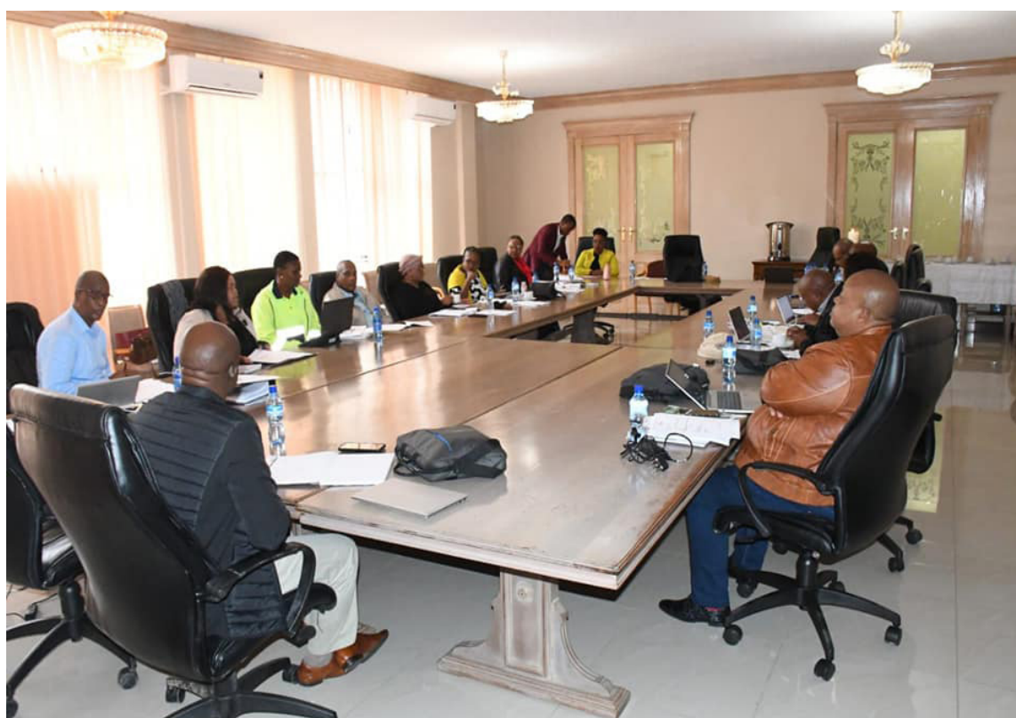
The Executive of the House of Traditional Leaders appreciated the presentation and discussions because it broadened their understanding of the department's legislative mandate

The Executive of the House of Traditional Leaders appreciated the presentation and discussions because it broadened their understanding of the department's legislative mandate. The meeting agreed that the department will present the act to the entire traditional council in the near future to ensure legislative compliance in all villages across the province.