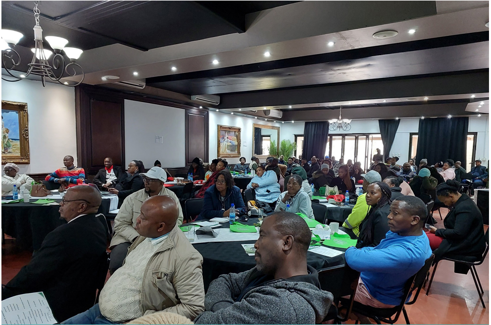
Attendees were given insights into various legislation on consumer affairs and how to protect themselves

DEDECTs Consumer Affairs recently commenced with the rolling out of its 2023/2024 awareness campaigns, with workshops and roadshows being held in all districts of the province to create awareness on Consumer and Business Regulations. The workshop aims to empower communities on their consumer rights, how to enforce them as well as empowering them on the work of other government institutions and regulatory bodies.