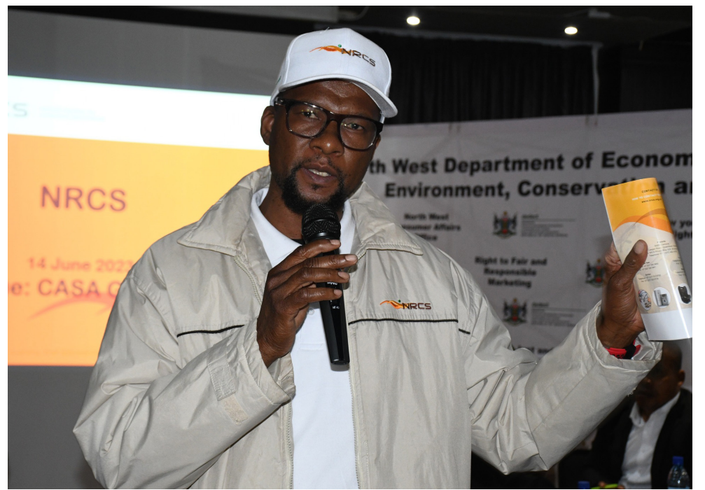
Provincial, national and local regulators give community members information to empower them to be better consumers

Other government institutions which participated in these workshops included Local Municipalities and Environmental health practitioners which covered consumer matters relating to their mandate including food inspection and environmental wellbeing. Representatives of the National Credit Regulator (NRC) were also present and covered issues of good credit practices and debt management. The Department will continue with these awareness campaigns and roadshows in all the district of the province in order to empower our consumer to make the right choices.