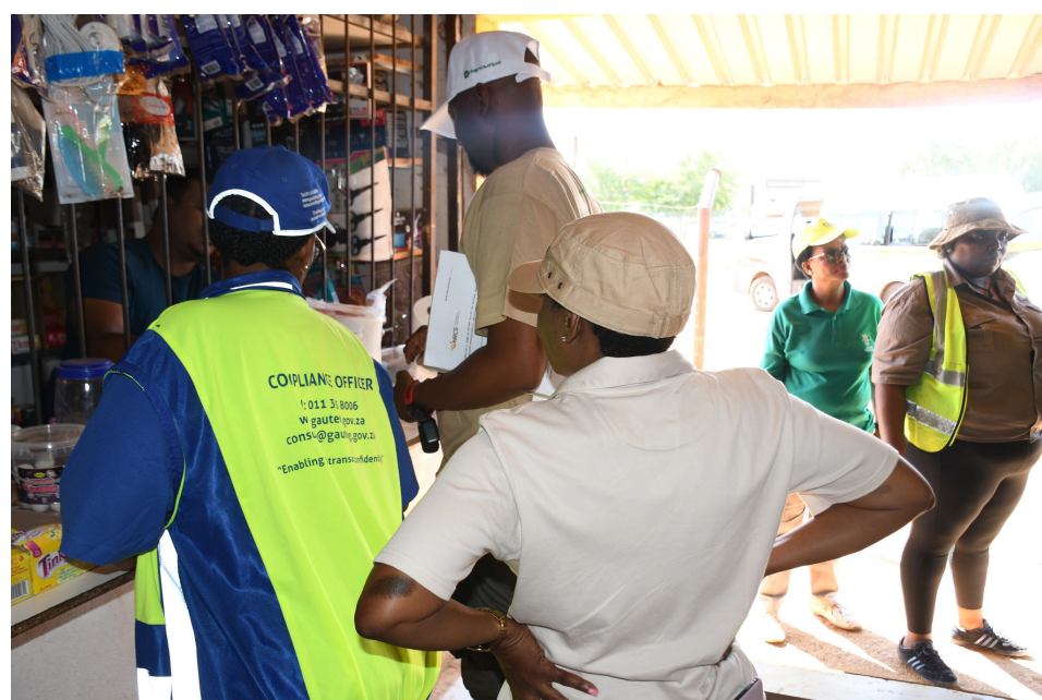
Joint operations teams inspect business a tuckshop for compliance

The government institutions which participated in the build-up programme include the Department of Home Affairs, Department of Employment and Labour, Department of Agriculture and Rural Development, Department of Trade industry and competition; National Regulator for Compulsory Specifications (NRCS), National Consumer Commission (NCC), Motor Industry Ombudsman of South Africa (MIOSA), ICASA, Council for Medical Scheme, Faisombuds, Credit ombuds; Council for debt collectors, Financial Sector Conduct Authority, Consumer Goods and Service Ombudsman, National Energy Regulator South Africa, District Municipalities' Environmental Health Practitioners, Local Municipalities Waste units, Departmental entities, and SAPS.