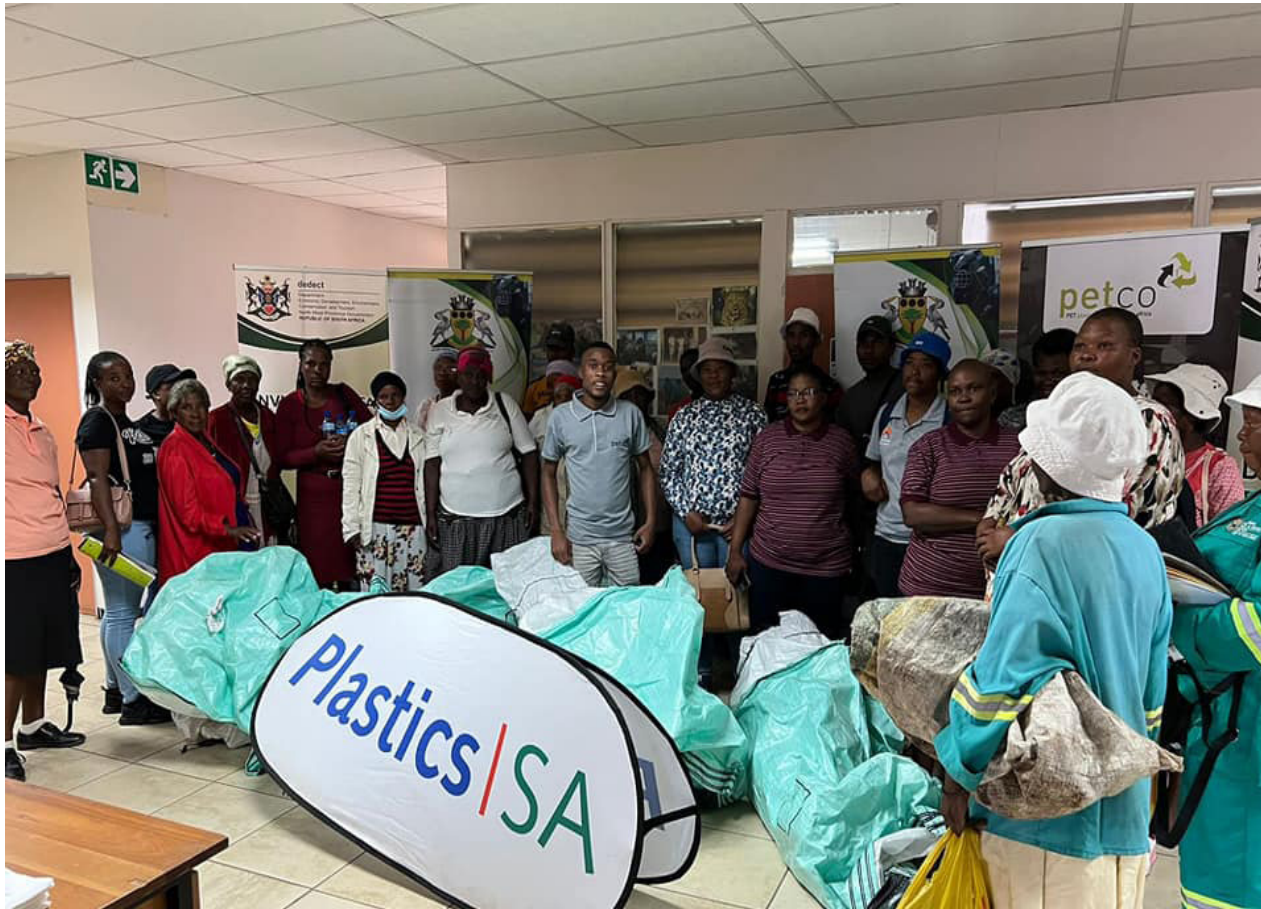
The workshop targeted waste reclaimers around Mahikeng who were empowered on general waste management and the benefits of re-use, recycling and the recovery of waste in public spaces.

T he department working together with the North West University Mahikeng Campus have afforded students studying towards a degree iThe DEDECT has participated in the Mahikeng Recycling Workshop, which is a project on the Separation of Waste at Source that the Ngaka Modiri Molema District Municipality together with the Local Municipality are piloting within the Mahikeng Local Municipality. The workshop which took place today at the DEDECT Office in the Industrial Site, Mahikeng, targeted waste reclaimers around Mahikeng who were empowered on general waste management and the benefits of re-use, recycling and the recovery of waste in public spaces.