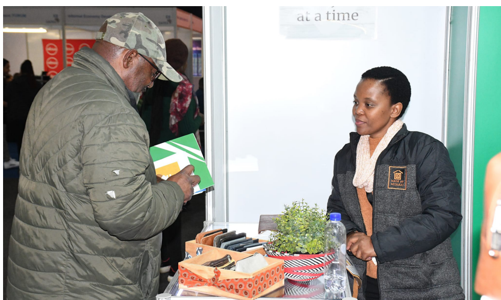
Made by Mosaic is one of the small businesses participating at the trade expo