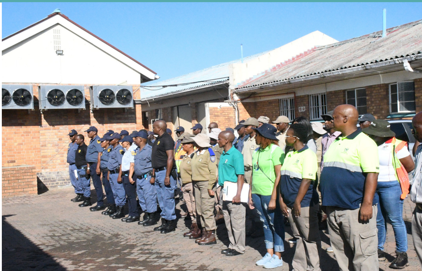
Joint operations teams get ready to inspect business for compliance and enforcement

The World Consumer Rights Day build-up programme led by DEDECT Consumer Affairs Office in collaboration with local, provincial and national regulators concluded a province wide enforcement and education campaign. The month long operation commenced in March 2023 in all districts, and concluded in the Rustenburg CBD and moved to Moruleng for the last day. The teams inspected compliance in terms of various legislations regulating the business industry.