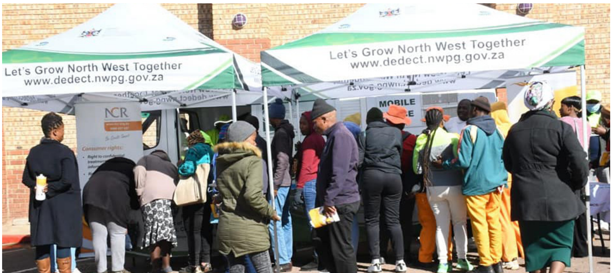
Roadshows were held together with workshops in an effort to target more consumer empowerment

The Department of Economic Development, Environment, Conservation and Tourism (DEDECT) is running a series of consumer workshops and roadshows during May and June 2023 to educate consumers about their rights and responsibilities. Education Officers from DEDECT Consumer Affairs, together with regulators from local, provincial and national government institutions conducted a series of consumer awareness workshops in all four districts of the Province.