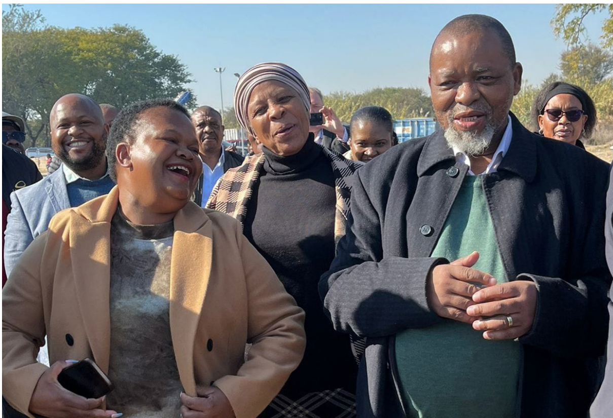
MEC Galebekwe Tlhabi and DMR Minister Gwede Mantashe on a site visit as part of the District Development Model

MEC Galebekwe Virginia Tlhabi is currently accompanying Department of Mineral Resources and Energy Minister Gwede Mantashe, and Bojanala Mayors on a site visit to the Brits water treatment plant. The plant is in the process of being renovated and improved and the delegation is monitoring progress of the project.