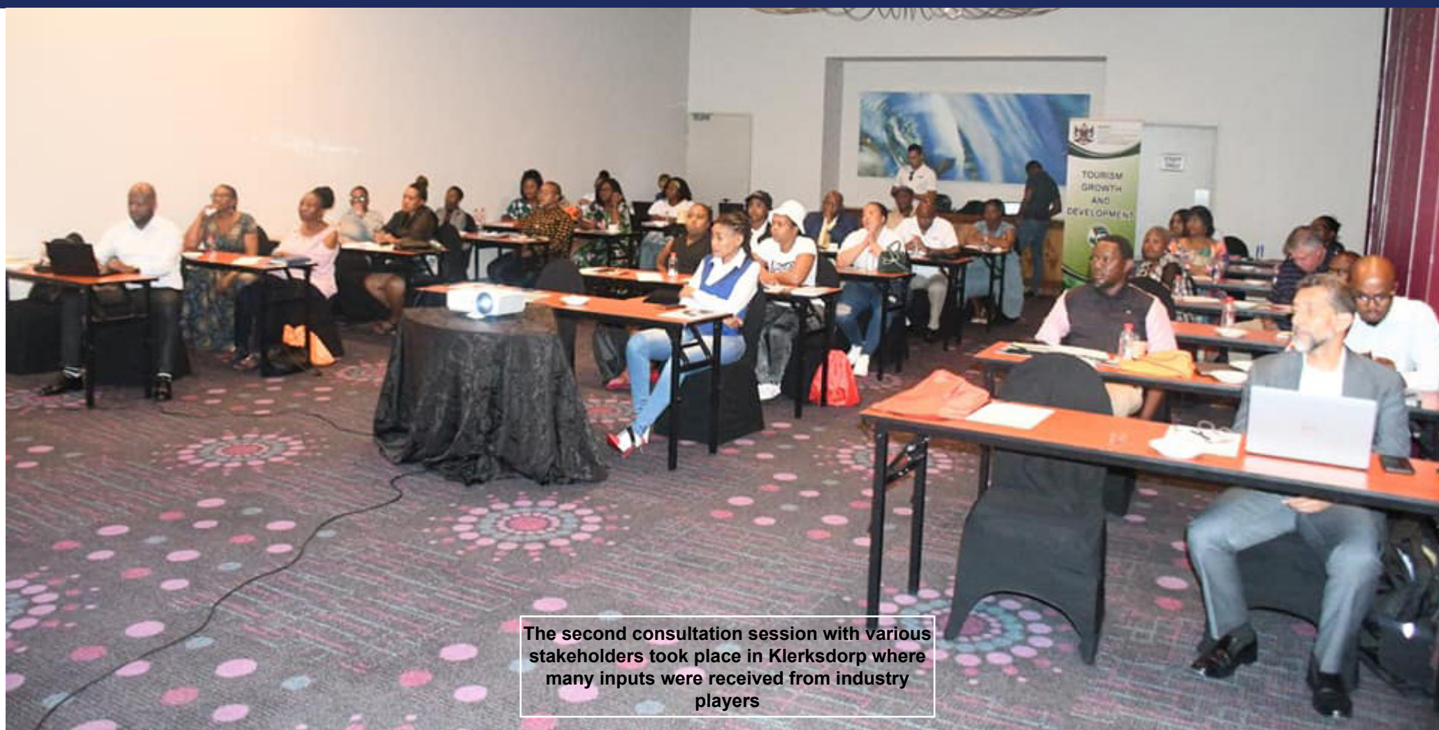
The second consultation session with various stakeholders took place in Klerksdorp where many inputs were received from industry players

The North West Department of Economic Development, Environment, Conservation & Tourism's (DEDECT's) Tourism directorate has begun resuscitating Provincial Tourism Sector Forums (PTSF) and its terms of reference, in order to provide an open platform for communication and planning amongst the private and public tourism industry stakeholders.