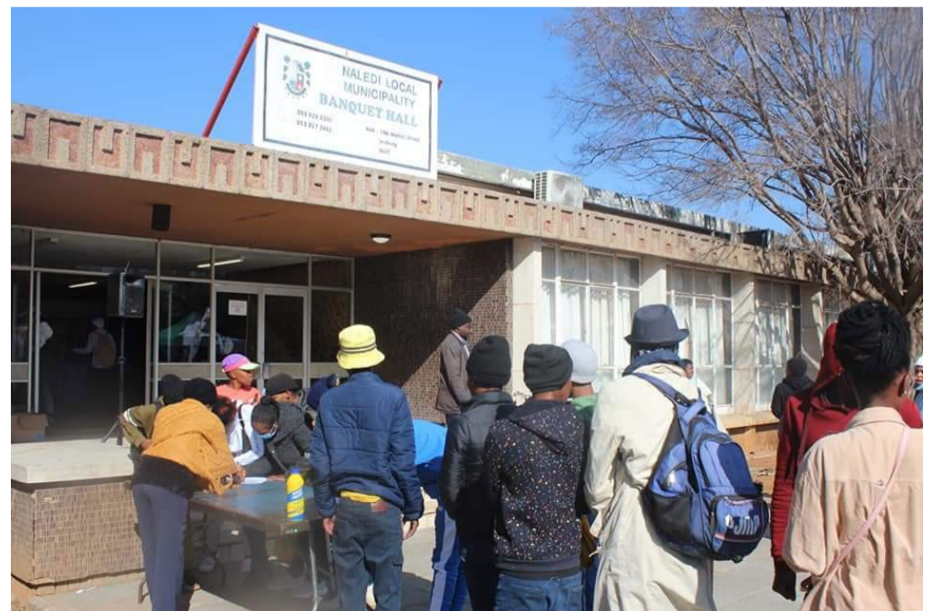
Attendees at the expo and Thuntsha Lerole session

DEDECT urged small businesses at the session to attend the Thuntsha Lerole Service Delivery Programme launch, where various government departments, Development Financial Institutions (DFIs), and municipalities will showcase their services and respond to the challenges small businesses are face with. The programme, adopting the District Development Model (DDM) approach, aims to expedite the delivery of quality services promised by the government to the people of the North West province.