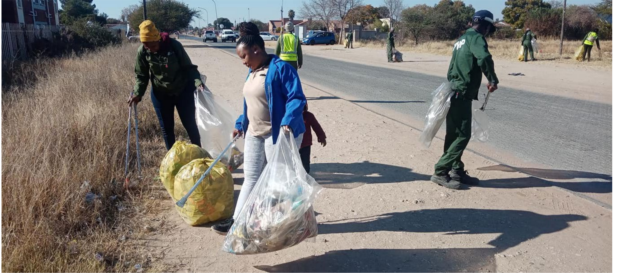
67-minute clean-up campaign in Extension 39, Mahikeng

In honor of Nelson Mandela Day, the Department of Economic Development, Environment, Conservation, and Tourism (DEDECT) partnered with the Global Enviro Foundation and Mahikeng Local Municipality to host a remarkable 67-minute clean-up campaign in Extension 39, Mahikeng. Focused on active citizenry and environmental conservation, the initiative was aimed at combating the effects of global warming while fostering a sense of community and shared purpose.