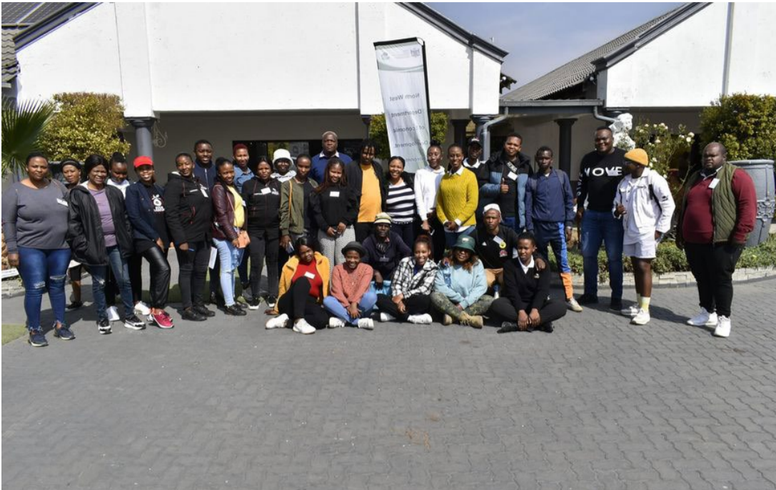
Tourism establishments after receiving advanced training on customer service

North West Department of Economic Development, Environment, Conservation and Tourism through its Tourism Transformation and Education Unit hosted a Tourism Skills Development Programme for 2 days at Seasons, Wedding and Conference Venue in Dihatswane Village in Mahikeng on 18 August 2023.