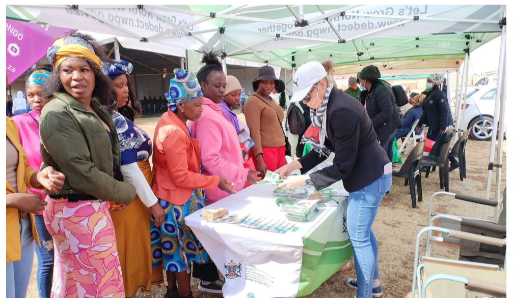
Government services were also on site to assist women attendees

D EDECT was at Ikageng Stadium in Potchefstroom, participating in the Provincial Women's Day Celebration organized by the Department of Arts, Culture, Sports and Recreation on 25 August.