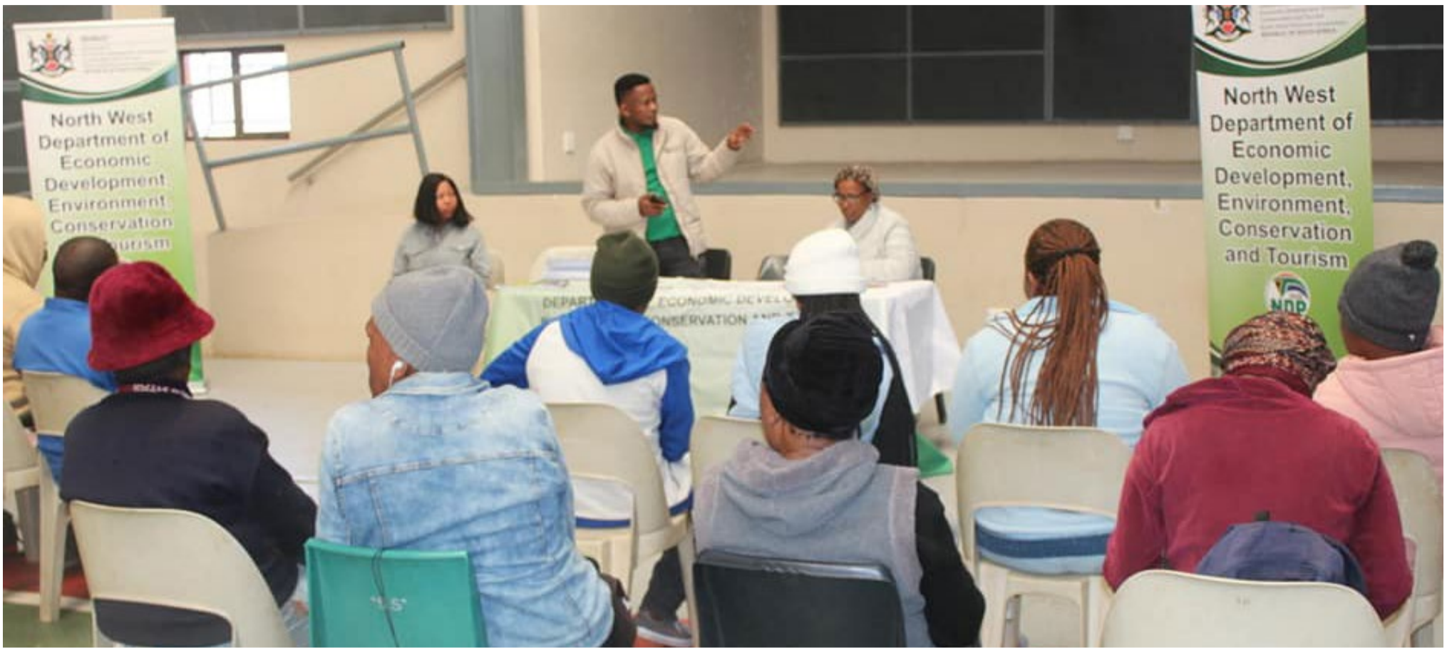
DEDECT officials empowering communities especially youth in the district about various services, training, employment, and small business empowerment support programmes available in government

D EDECT participated in the Youth Empowerment Expo hosted by the Department of Forestry, Fisheries and the Environment, and Dr Ruth Segomotsi Mompoti District Municipality at the Naledi Local Municipality Banquet Hall. The Expo which was officially opened on 26 July aimed at empowering communities especially youth in the district about various services, training, employment, and small business empowerment support programmes available in government and its agencies, as well as corporates from the mining, agriculture, hospitality, information communication technology sectors.