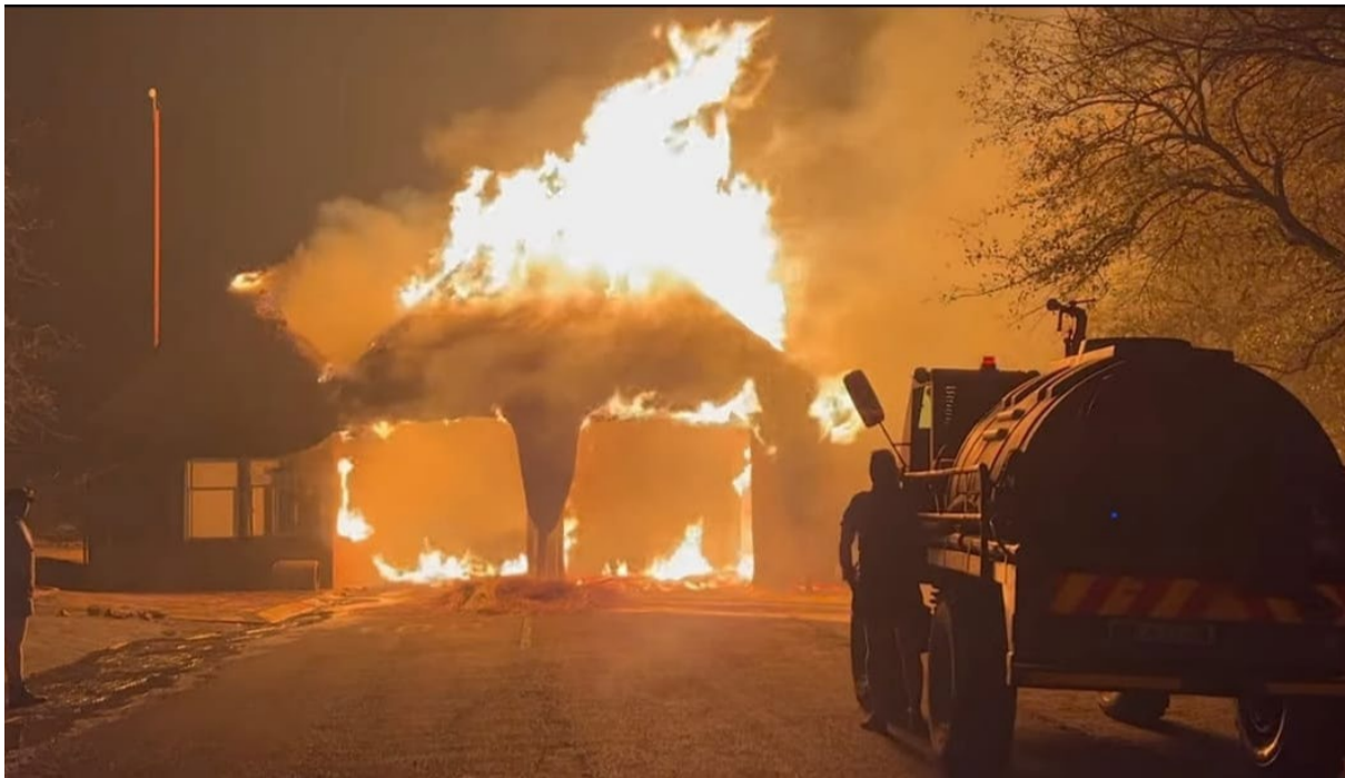
The fire spread across the Manyane Resort and gutted 27 chalets and the entrance building

The Department of Economic Development Environment Conservation and Tourism (DEDECT) in the North West Province would like to inform the public about the fire outbreak that gutted Sun City's Cabanas Hotel and Manyane Resort on the 16th September 2023 at Mogwase, Moses Kotane sub-district.