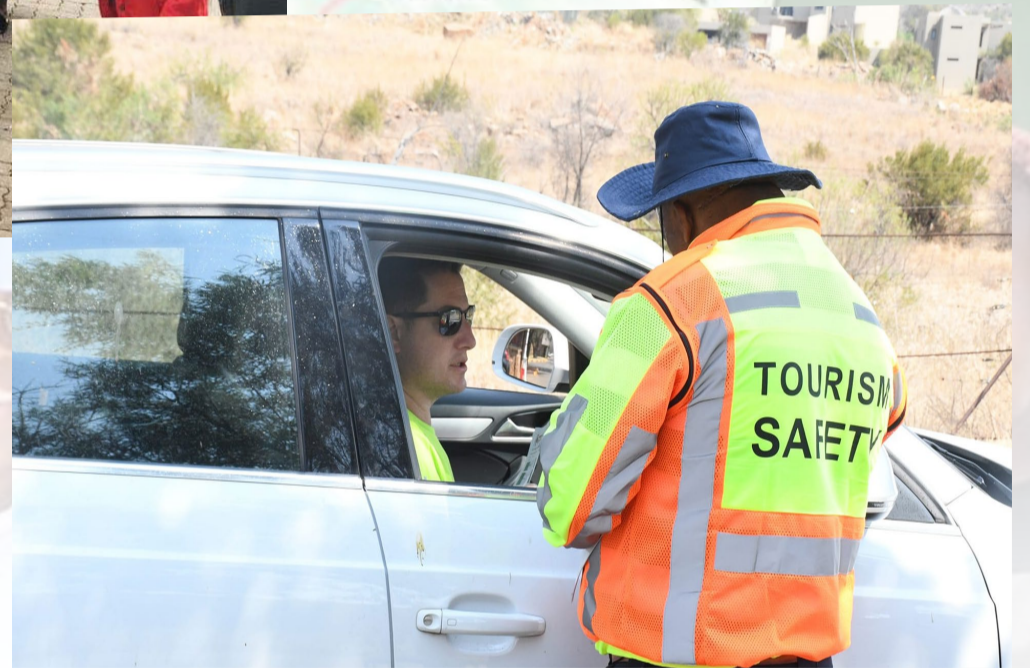
Some of the visitors to our Parks who and our Tourism Safety offices conducting inspections

P arks Mahala Week is an initiative of the North West Tourism, that aims to promote domestic tourism and encourage people to learn more about their surroundings and tourist destinations. During Parks Mahala Week, entrance to all provincial parks and nature reserves is free for South African citizens and residents.