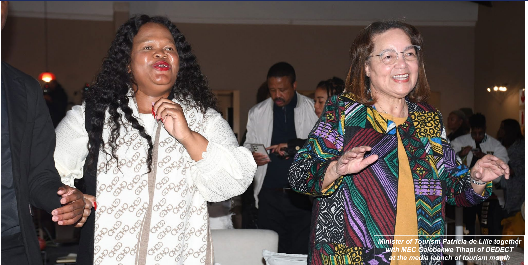
Minister of Tourism Patricia de Lille together with MEC Galebekwe Tlhabi of DEDECT at the media launch of tourism month

The tourism industry, led by Minister of Tourism Patricia de Lille, came together for the launch of Tourism Month 2023 on 1 August, and to reflect on tourism’s vital role in our country’s growth and development particularly, domestic tourism.