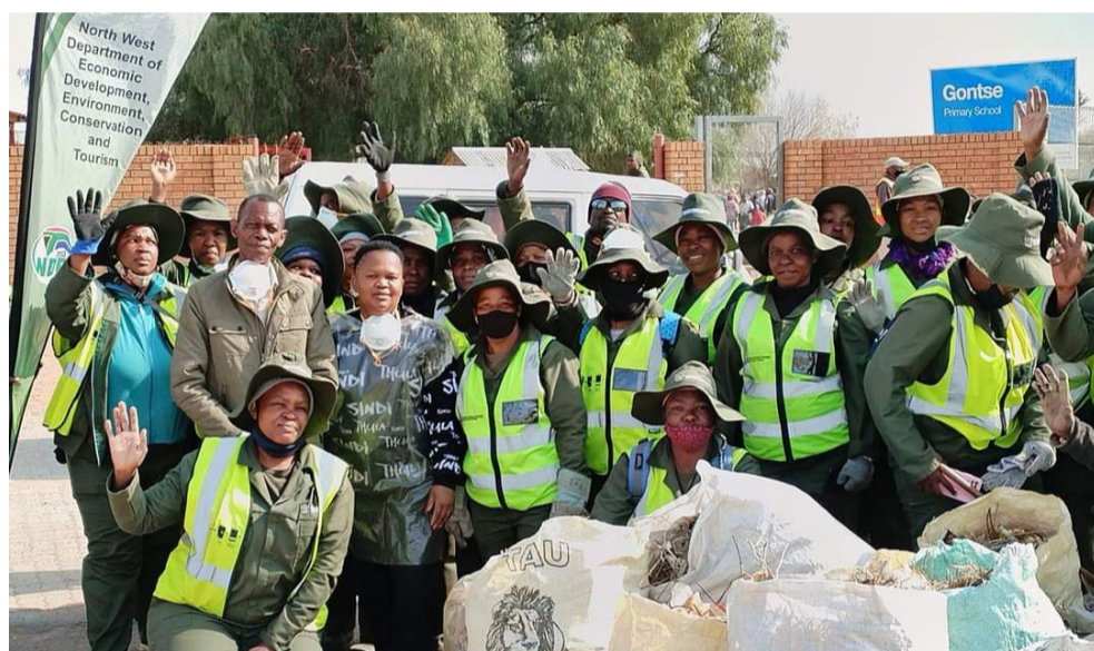
MEC Virginia Tlhabi hands over equipment to business owned by local entrepreneurs and takes part in a cleaning and awareness campaign

DEDECT's service delivery programme during the Thutsha Lerole at Wolmaransstad on 19 August empowered the local businesses to participate in the mainstream economy by handing over equipment for the growth of their businesses and job creation in the area. The equipment included essentials such as a stock and freezer for a tuck shop business, machines for car wash operations, salon and catering tools, and a jojo tank for the Tsweleng Youth Enterprise Entrepreneurial Development Centre.