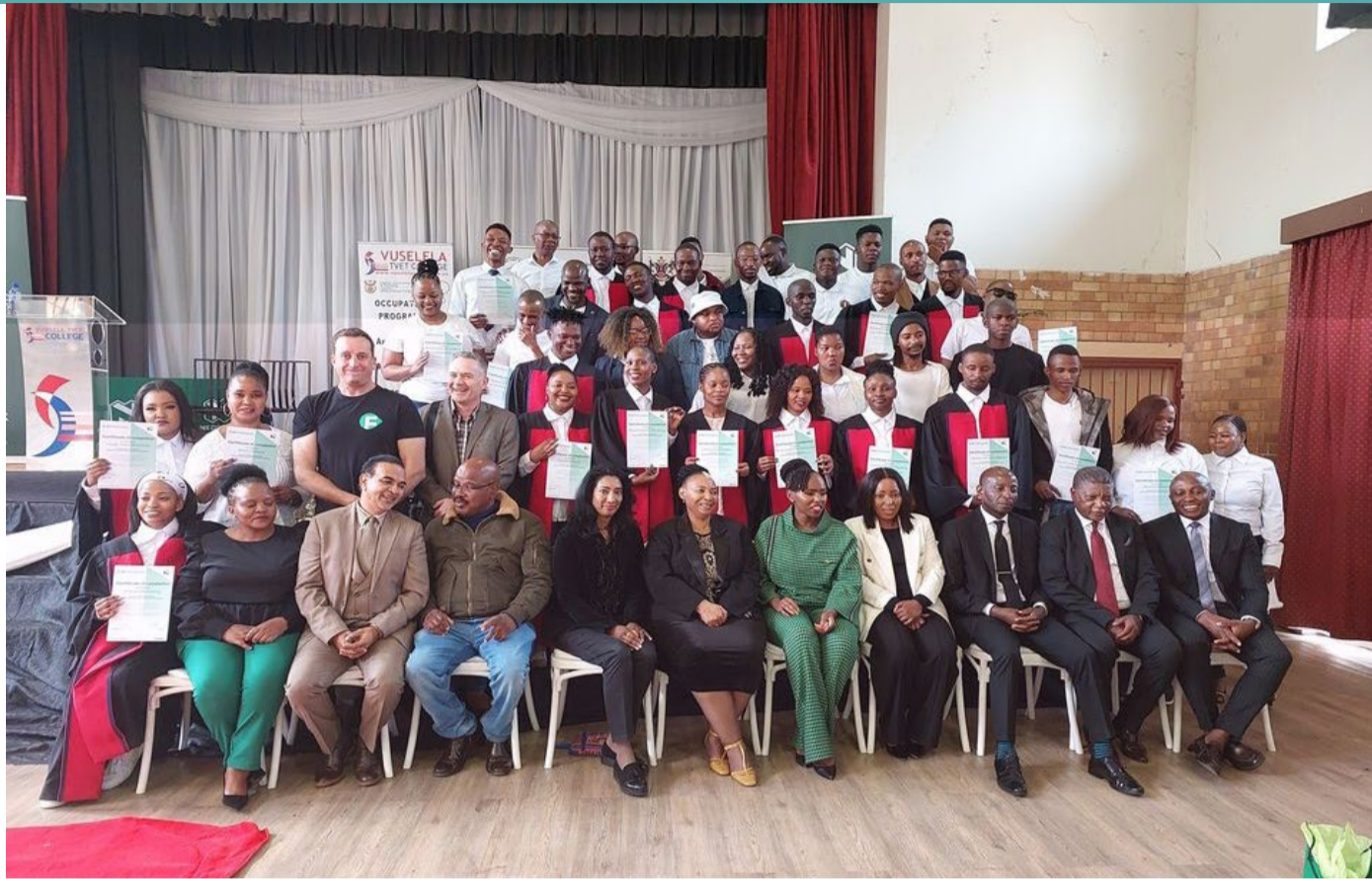
63 graduates have completed the first phase of a business training programme and graduated at a ceremony held at Vuselela TVET College in Potchefstroom

The 17 August was the day we celebrated the first group of young TVET college students who formed part of the Nedbank North West Youth Entrepreneur Programme in collaboration with the Department of Economic Development, Environment, Conservation and Tourism (DEDECT), Fix Forward, Vuselela, Orbit and Taletso TVET Colleges.