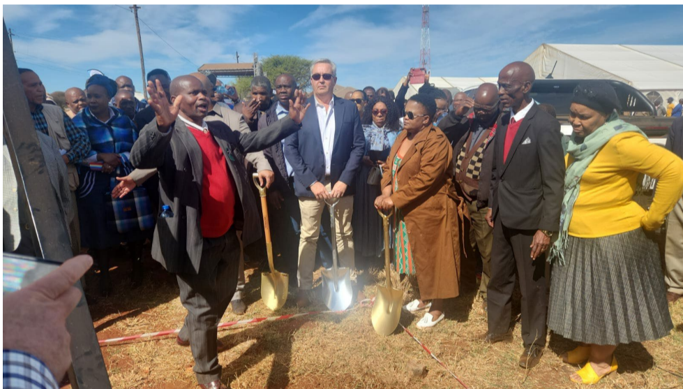
Sod Turning ceremony for the new mall

The groundbreaking ceremony not only signifies the commencement of the construction of a shopping mall, but also stands as a symbol of progress, prosperity, and a testament to collaborative efforts between governmental bodies, traditional authorities, and community representatives..