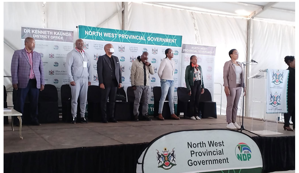
Acting Premier and EXCO members address attendees