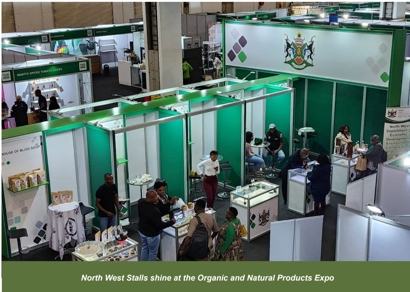
North West Stalls shine at the Organic and Natural Products Expo

N orth West Provincial Government through DEDECT is yet again taking centre stage at the Organic and Natural Products Expo Africa, thereby ensuring that its SMMEs and Cooperatives are not being left behind, but claiming their space in this Africa's biggest trade fairs which is taking place from 14 – 16 September 2023 at the Sandton Convention Centre, Johannesburg.