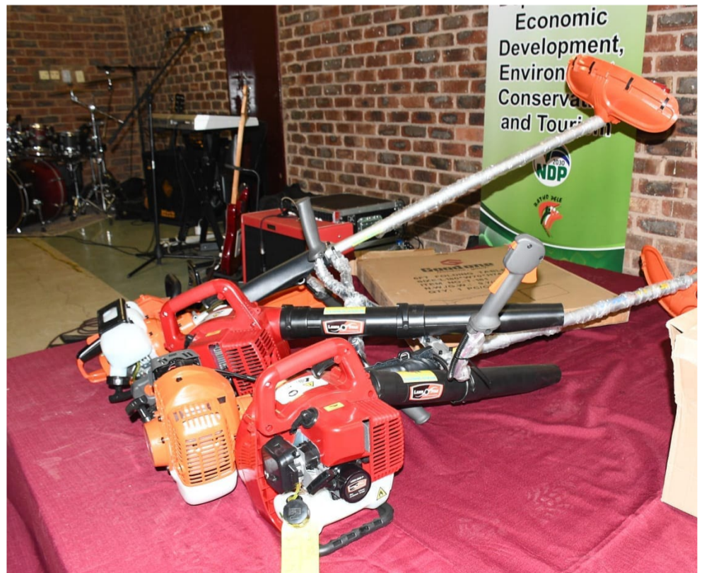
MEC Galebekwe Virginia Tlhapi hands over equipment to Gomotsegang Garden Services