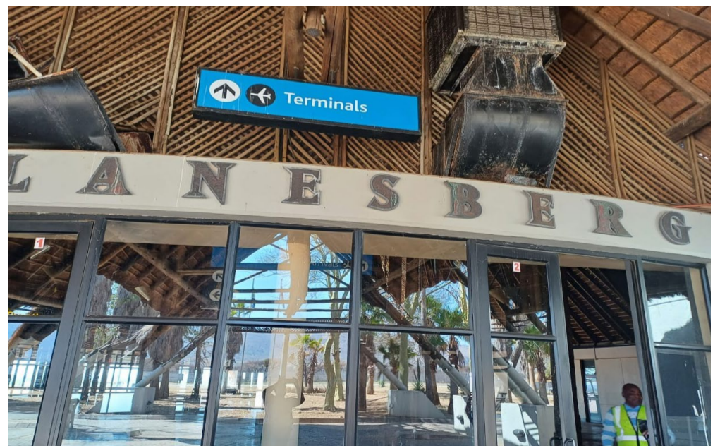
MEC for Economic Development, Environment, Conservation, and Tourism, Ms Virginia Tlhapi, along with Ms Lebogang Diale, the Acting Head of the Department, had an unannounced visit to assess the extent of the damage.

This endeavour not only stands as a demonstration of the importance of the airport as avital economic resource, but also signifies a positive step towards encouraging collaboration between the public and private sectors in growing the economy of the province.